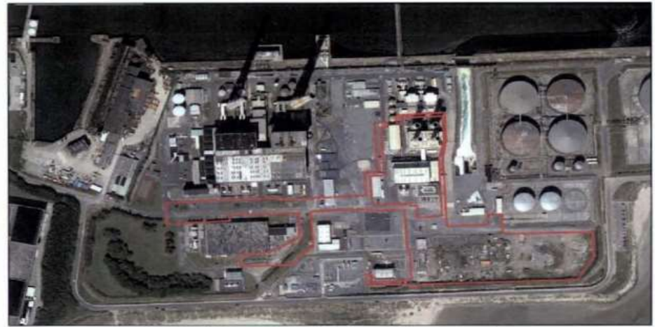
Plate 1 Aerial View of General Site Area and immediate environs

The proposed station at Poolbeg would run primarily on natural gas and rely on diesel as a backup fuel. In addition to the additional greenhouse gas emissions these plants will generate, there are also other environmental impacts that should be considered. The Department of Culture, Heritage and the Gaeltacht noted the unique archaeological potential of the area as the seabed below the site possibly contains wrecks.<sup>189</sup> Dublin City Council (DCC) found that '[T]he rationale for the location of the development is unclear' referring to the site's proximity to four protected environmental sites, including Bull Island, a Natura 2000<sup>190</sup> site home to a rich variety of mammals, birds, fish, and insects. Waders, light-bellied brent geese, and waterfowl are commonly sighted in the 'hundreds of thousands' at the island. Dublin Bay's status as a UNESCO biosphere requires special protection as an area 'not just of ecological value, but also areas around them and the communities that live and work within these areas.<sup>191</sup>